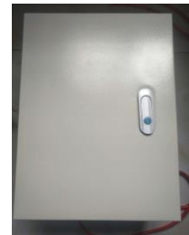
Battery and controller housed in lockable cabinet.

Can be combined with a variety of optional lighting sources including Geckolighting LED streetlights, LED floodlights and/or other 12VDC products (up to max 50w for overnight use).