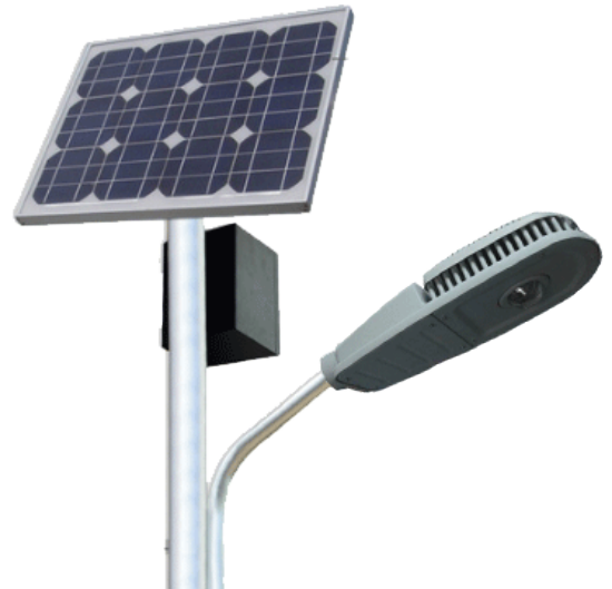
Setup showing optional Geckolighting 40w LED streetlight.

The kit consists of a solar panel for pole top or roof top mounting and a separate controller/ battery box that can be mounted close to or away from the solar panel. This allows the panel to be mounted in the best position, the controller/battery box in the best position and the LED in the best position.