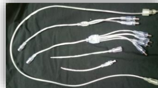
Range of Light bar accessories