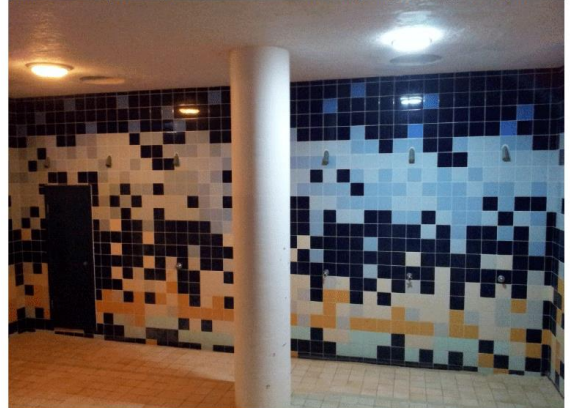
Geckolighting LED Oyster Light